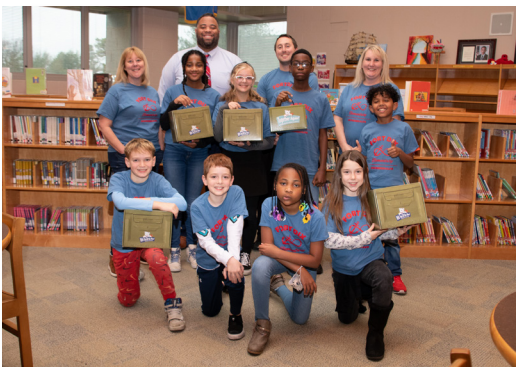
Students at Fort Dix with parents set for deployment received kits as a part of their Anchored4Life character education program.