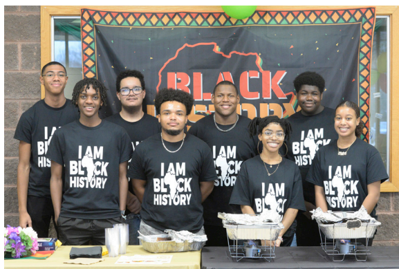
Students in the PTHS Black History Club served lunch to administrators, staff members, students and community officials at their annual luncheon.