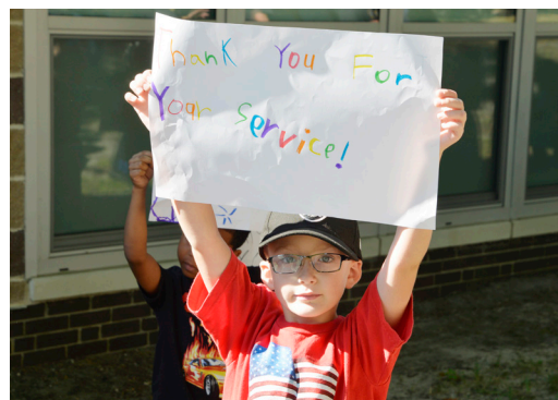
Stackhouse students showed their support for the Pemberton Township Police Department with a Hero Parade, an event that exemplified the core values of respect and service.

Pemberton Township Schools’ five selections were the most of any school district in New Jersey in 2023.